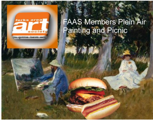
FAAS Members Plein Air Painting and Picnic

June 25 th FAAS will be holding a Plein Air Painting event and picnic for members of the society. Painting starts at 10:00 am for those who wish to participate. The picnic starts at 12:00 pm.