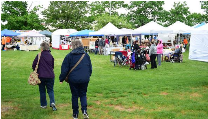
For more visit the article at: PICTURES: Amp up the Art, Art in the Park Show in Forks Township.

A special thank you to all the artists, crafters, vendors, musicians, and everyone who attended in this year's Amp Up the Art event on Saturday, May 20 th . Sharing your time and talents to support the arts is commendable! With all sincerity, "Thank you"!